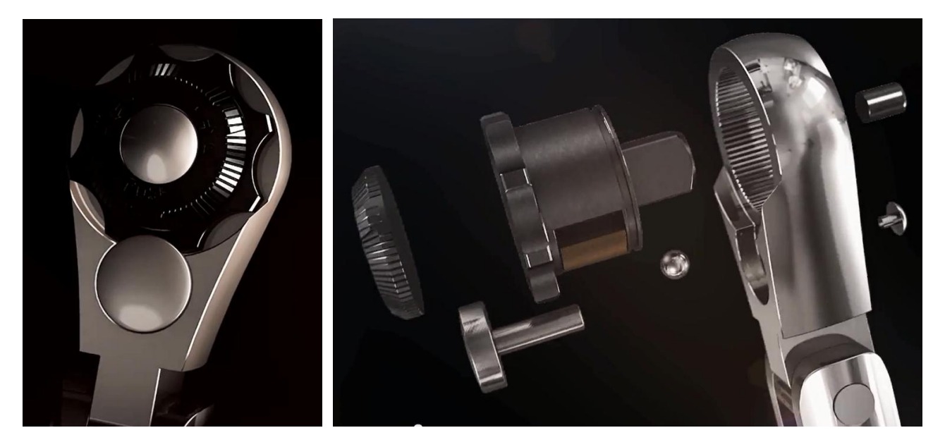
Precision 72 teeth designed to snug fit attachment

The ordinary ratchet wrench has tooth failure and worn teeth problem. Now, the new innovation product -2 in 1 ratchet & flexible installs the limiting device to solve this problem.