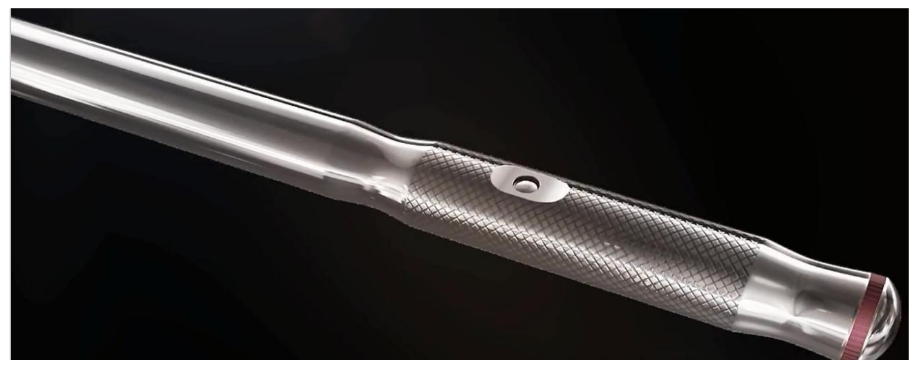
Stretching handle to break through the confined